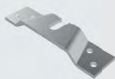
Flange 8069, 4 pieces