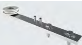
Deflection unit 3 203009-U3