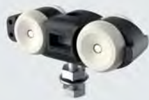
Hanger RX100A, 4 pieces

NEW: now can be combined with an intake damper for perfect closing action!