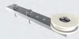
Deflection unit 1 203009-U1