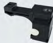
Adjustable stopper SX 100H, 2 pieces