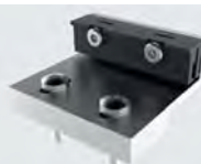
Catcher 1 203009-1