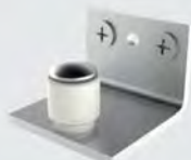
Guide roller for side-by-side doors, 15 mm, 15 mm, 204129