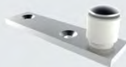
Guide roller on flange, 15 mm, 18129