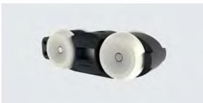
Hanger RX100A, 2 pieces

Quality hardware with minimal height for wooden doors. Now with anodized components and integrated height adjustment for easier assembly.