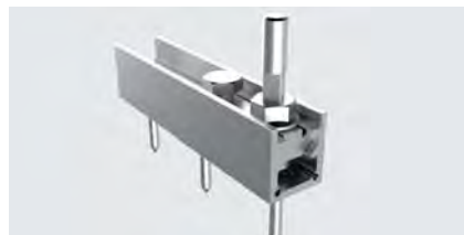
MX Support flange 202083A-45NEO, 2 pieces