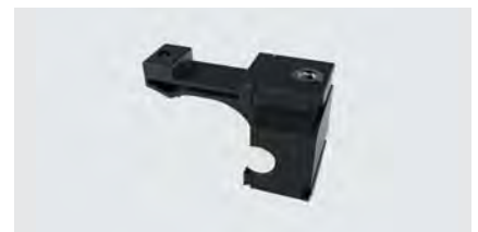
Adjustable stopper SX 100H, 2 pieces