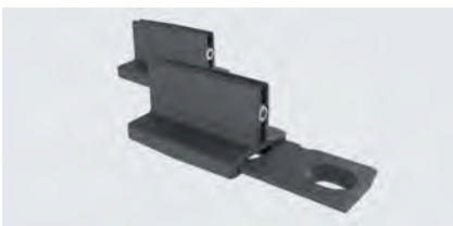
Floor guide T-Guide Holz