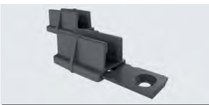
Floor guide T-Guide Glas, 2 pieces