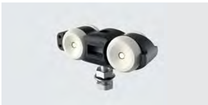
Hanger RX100A, 4 pieces