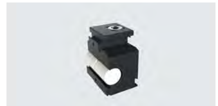
Adjustable stopper SX100, 4 pieces