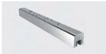
Glass clamp GLM 274087M, 4 pieces