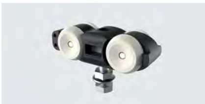
Hanger RX100A, 2 pieces

This complete set offers a modern entry-level version for all door and sliding elements made of wood. Fully equipped with all the necessary components, this set is the door opener to our premium line.