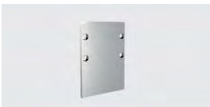
End caps set 177427-24