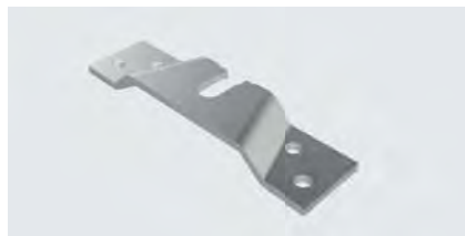
Flange 8069, 2 pieces