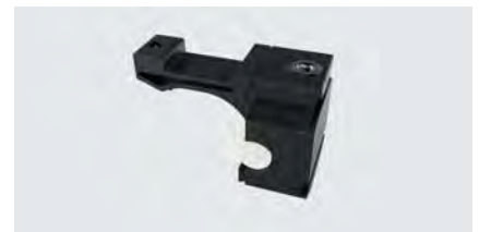
Adjustable stopper SX 100H, 2 pieces