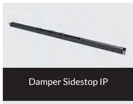
Damper Sidestop IP

Accessory Kit Soft Close for ALU 100 NEO consists of: